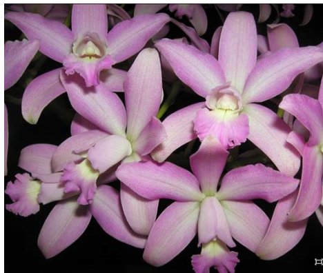
Cattleya Tanya Lam 'Bud Seagraves' HCC/AOS

After seeing plants grow in their habitats in Thailand, Brazil, Ecuador, China - Tanya determined to make a change to overcome her environment challenges. Her collections are now changing with the new successes, and she will continue to try growing many species that were avoided before. She has received AOS awards, and is most proud of two hybrids that were named for her.