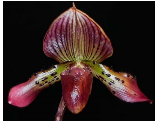
Paphiopedilum Tanya Lam ( Maudiae x tigrinum )