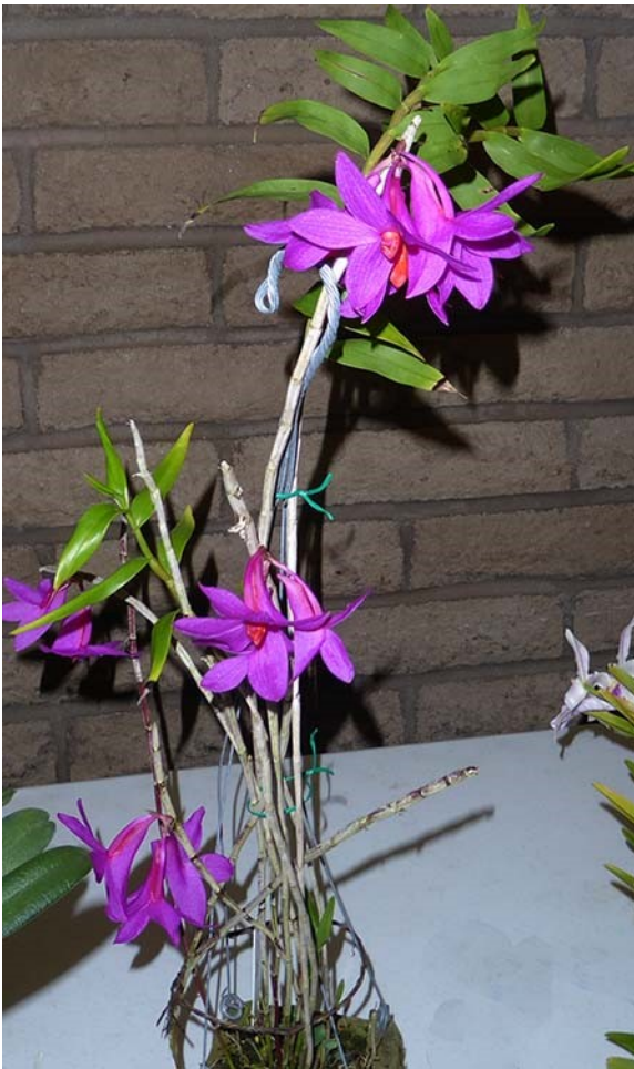
Dendrobium sulawesiense (Syn. Dendrobium glomeratum )