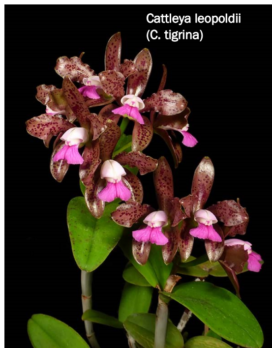
Cattleya leopoldii (C. tigrina)

still cooler than a lot of places (70 deg. F. nights in California are better than 90 deg. nights in much of the rest of the country!)