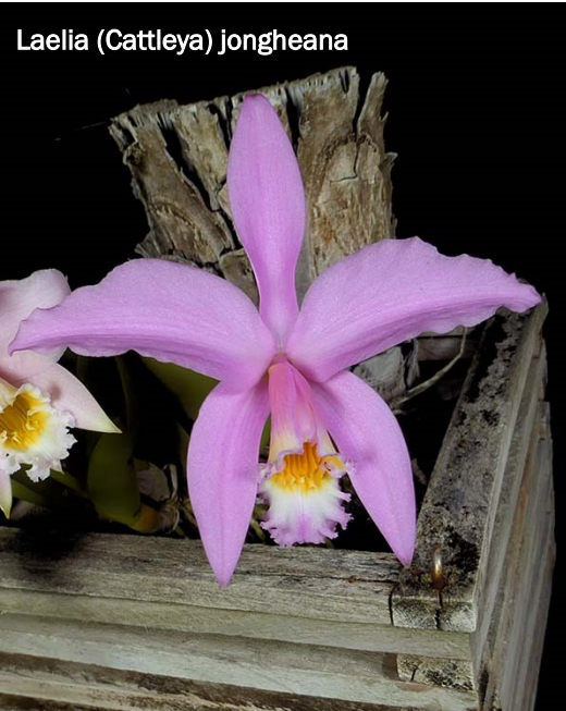
Laelia ( Cattleya ) jongheana

I have one European terrestrial orchid that has managed to bloom so far, a few others waiting in the wings. Serapias cordigera just opened. There are still several flowers behind this one, but I figured that I'd better grab a photo of the first one—I have had the experience of getting one and having the plant decide it is done. My success rate is not what I would wish, but I'll take what I can get. And keep trying. The fuzzy lip on this one is best appreciated in a photo. The species is native to a very large area, from North Africa through the Mediterranean and as far north as Austria.