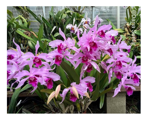
Laela purpurata f. concolor