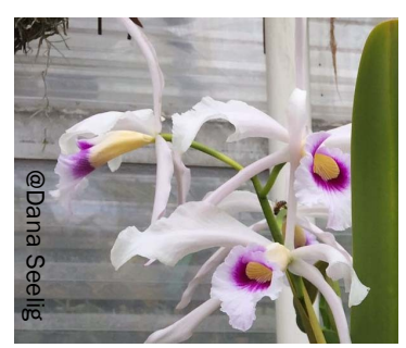
Laela purpurata f. anelata