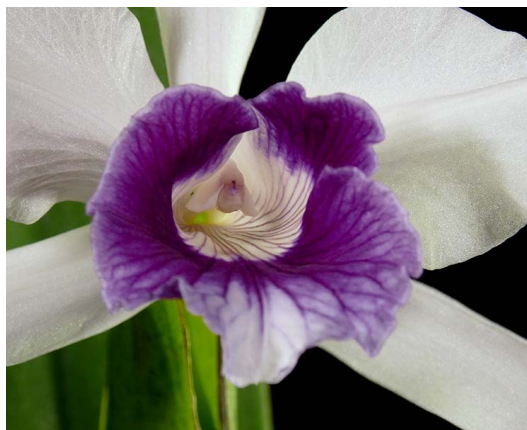
Laelia purpurata var. roxo-violeta