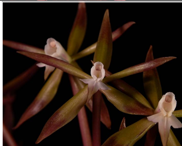
Epidendrum lacustre 'Wow Fireworks'