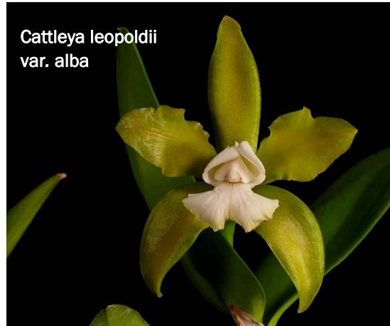
Cattleya leopoldii var. alba