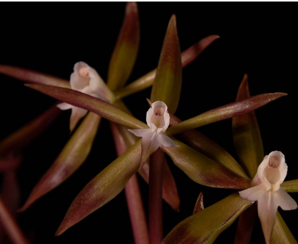
Epidendrum lacustre 'Wow Fireworks'

requirement is the tricky part. That is solved with media. The L. anceps are all mounted, or in baskets with minimal media so no matter how often they get watered, they dry out quickly. Epi. lacustre is in a plastic pot with sphagnum, directly under a sprinkler, so it stays pretty wet. Last summer, after it bloomed, I moved it to a larger pot, but the roots were so good, and so entangled in the sphagnum (which was also good), that I just popped the whole thing into a larger pot and added more moss. I hope that at least some of the spikes will still be presentable at meeting time.