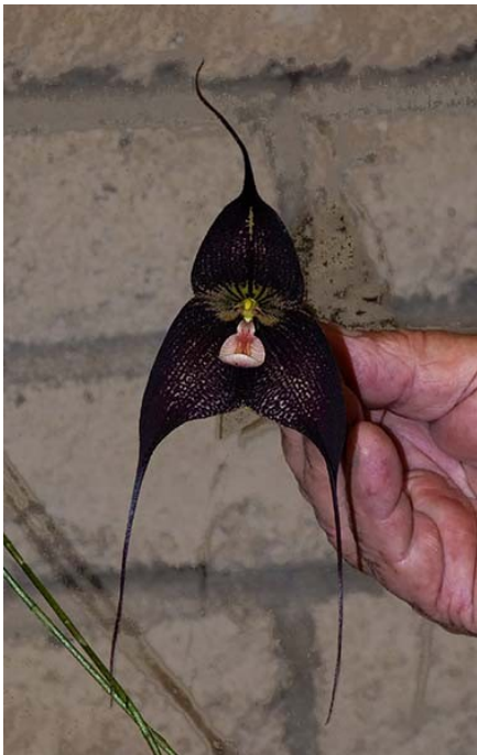
Dracula Raven ( D. vampira x D. roezlii )