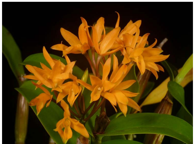
Cattleya ( Guarianthe ) aurantiaca var. aurea 'Lemon Drop'