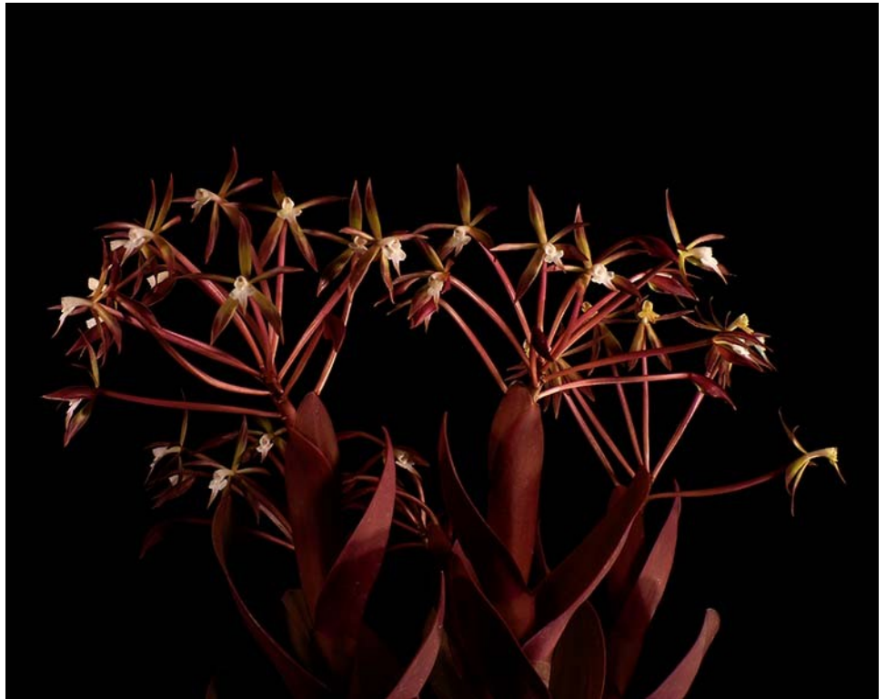
Epidendrum lacustre 'Wow Fireworks'

I had a bit of a triumph for an orchid species at AOS judging. Epidendrum lacustre (Panama purple form) put on a spectacular show this year. I have had the plant for a couple of years, two blooming seasons. Last year, I got one spike with about eleven flowers (at least visible in the photo) This year, five spikes full of dra-