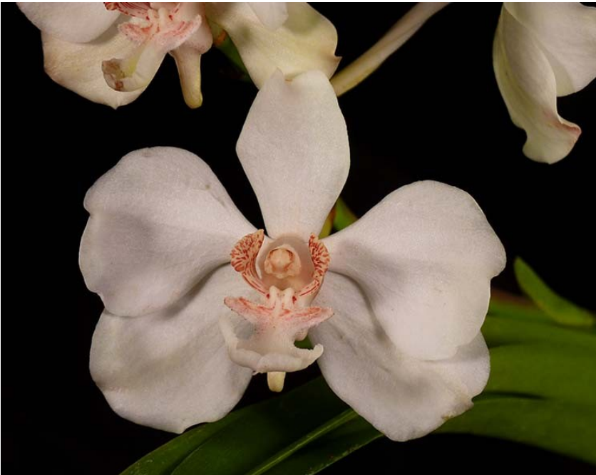
Labeled Vanda javierae , almost certainly Vanda barnesii