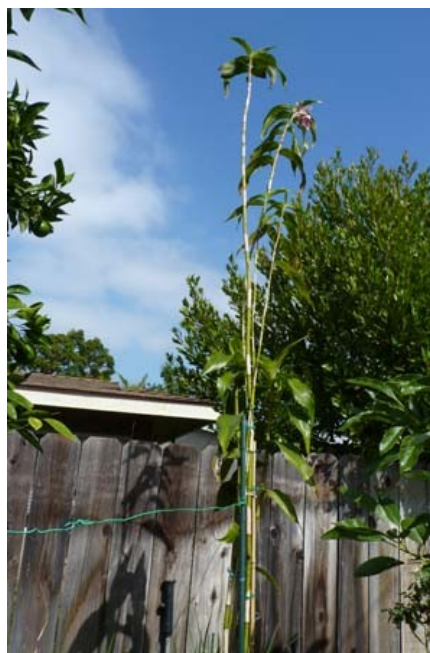
Sobralia caliglossa in bloom