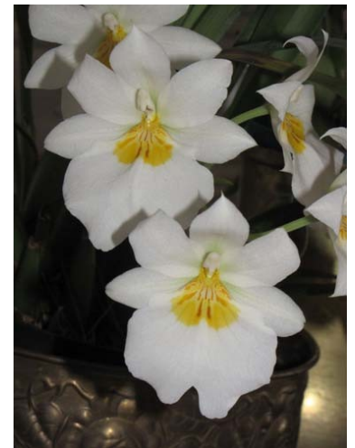
Miltoniopsis roezlii alba