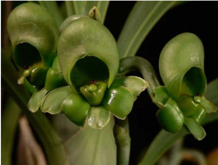
Catasetum expansum female flower