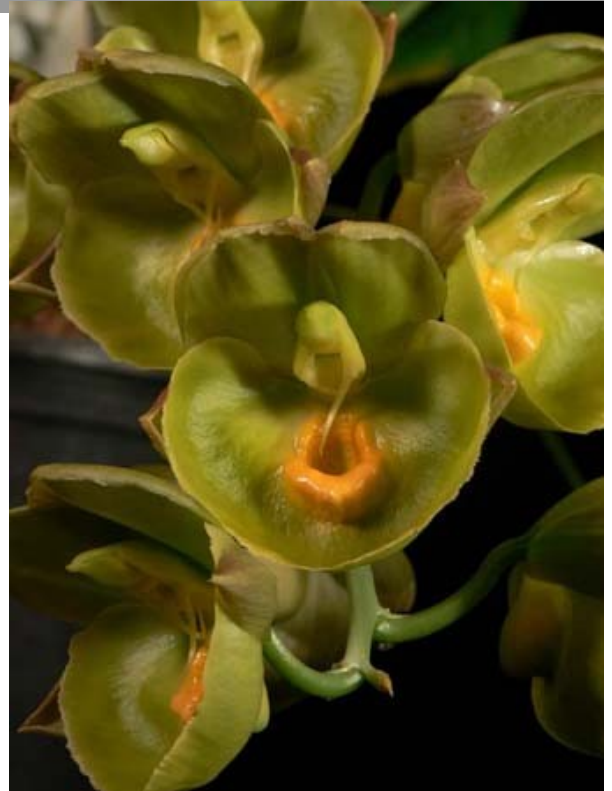
Catasetum expansum male flower

His pioneering work in Catasetum intergeneric hybrids led to the development of several notable hybrids, most recently the grex, Fredclarkeara After Dark, which produced “the blackest flower ever witnessed”. This grex has received eight FCC’s and three AM’s on the first flowers shown for judging!