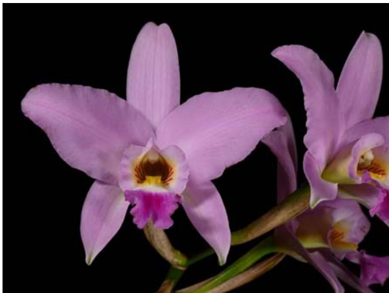
Laelia anceps 'Pink Snow'