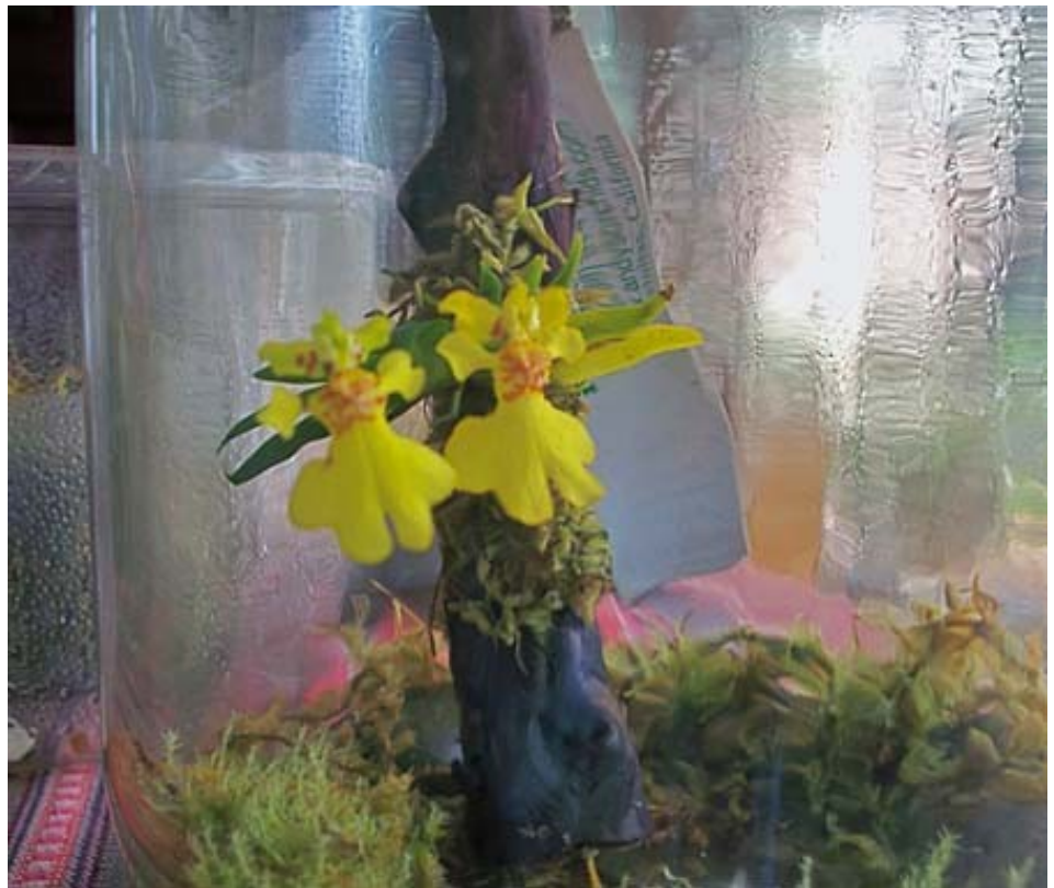
Barbara's Oncidium pusilla growing in a pickle jar