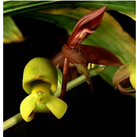
Catasetum callosum Female and Male Flowers

In a Powerpoint presentation Harvey Brenneise will give an overview of Darwin's life, specifically his interest in orchids, as shown by the publication of his first book after Origin of Species (1959), On the various contrivances by which British and foreign orchids are fertilised by insects, and on the good effects of intercrossing (1862). There are