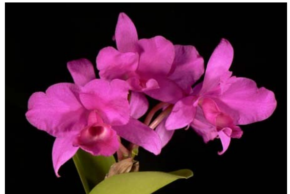
Guarianthe (Cattleya) skinneri

In the process of searching for cultural information about a new acquisition, I found a guide to Ecuadoran orchids, with 200 pictures and location information. The link is http://fm2.fieldmuseum.org/plantguides/guideimages.asp?ID=274 , and it is within the website of the Field Museum in Chicago. The home page for a large group of references to tropical plants is http://fm2.fieldmuseum.org/plantguides/default.asp . Under Rapid Color Guides search for Orchidaceae, and you will find several references. The one I used was Pichincha–Maquipucuna Orchids . What was I looking for? I won an Elleanthus gramminifolius from a plant table. The genus Elleanthus is related to Sobralia . For most that I have seen, the plant looks very similar, but the flowers are tiny and grow in a cluster. This plant is much smaller than the ones that I'm familiar with, and has very thin grass-like leaves.