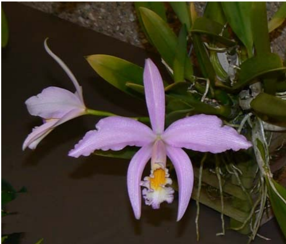
Laelia johgheana , close up