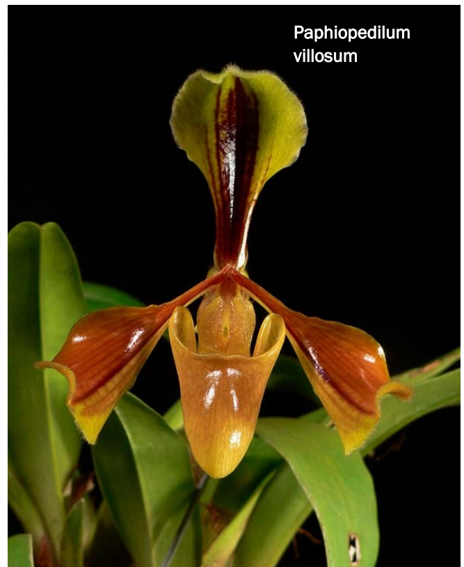
See: Editor's Potting Bench, Page 4

Some of the "regulars" of the season are right on time or maybe a little early. Paphiopedilum villosum is doing nicely, with three flowers open. There are other new growths, so there may be another blooming in the near future.