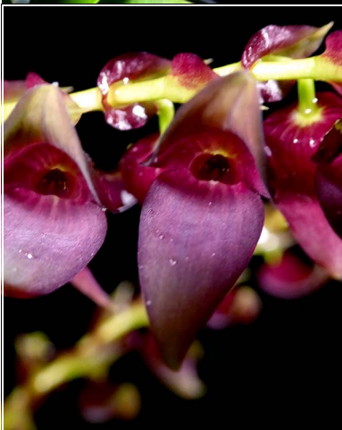
Stelis purpurea open for early risers.