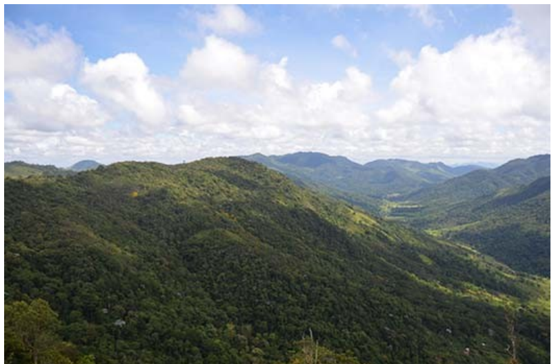
Reserva Serra Bonita, Bahia, Brazil