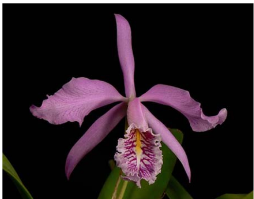
Cattleya maxima typical color form, highland type