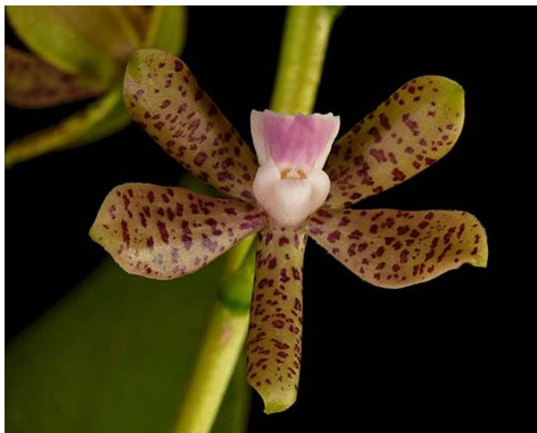
Prosthechea vespa , first bloom