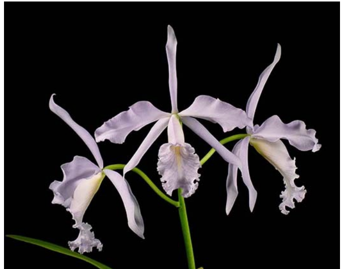
Cattleya maxima var. coerulea

C. maxima is native to Ecuador, Colombia, and Peru. It was found first in the hot, humid lowlands around Guayaquil, Ecuador. Later, populations were found on the Western slopes of the Andes in northern Peru, southern Ecuador, and Colombia, at elevations as high as 1800 m (6000 ft.). The highland plants tend to occupy areas that are fairly dry. This may be a reason for the highland variety not doing well outside of the greenhouse in winter—orchids are better able to tolerate cold weather when they