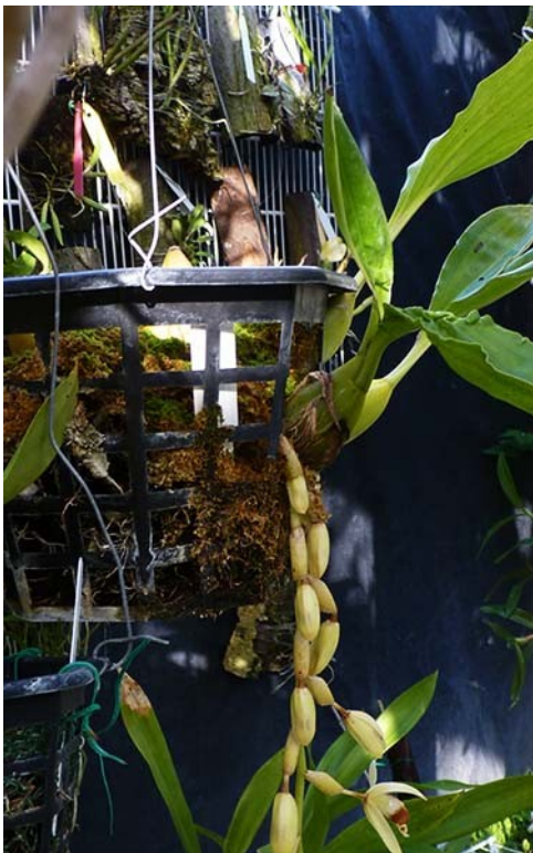
Coelogyne pseudobulb and inflorescence emerging from side of clipped basket

Each orchid species has its special charms, but some have particularly unique characteristics that require a bit of extra attention. One is Coelogyne flaccida . I have found that most of the Coelogyne s, especially the cooler-growing ones that I grow outside, do better in a basket than a pot. There is a group of them with multiple-flowered inflorescences, which usually arch over the edge of the basket, then hang down. Other genera, with inflorescences that grow sideways or downward (such as Gongora and Stanhopea ) usually manage to find the holes in the basket, follow the path of least resistance, and reach out of the basket. Occasionally a spike will get hung up and need to be freed, but generally the young inflorescence has enough substance to respond to