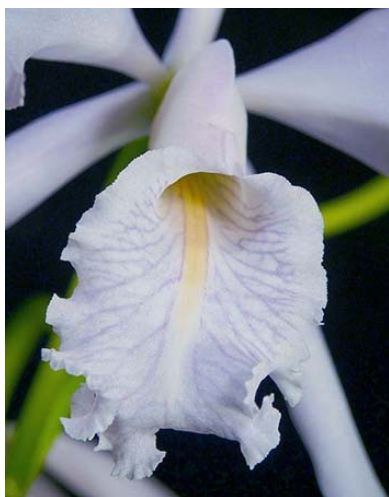
Cattleya maxima var. coerulea lip detail