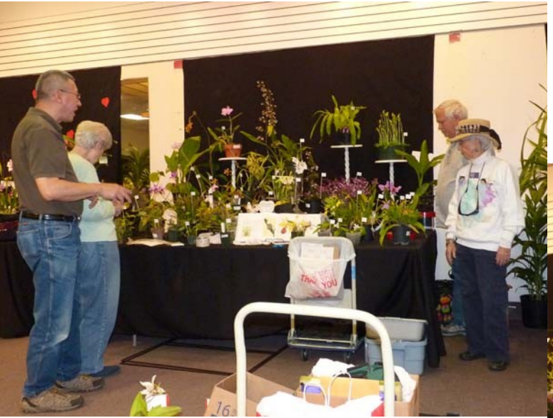
The team at work

pleasing design. The AOS judges who judged the displays thought so too, and we won a third-place trophy!