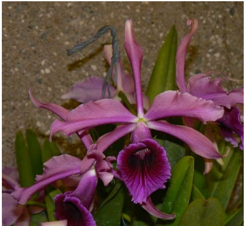
L. purprata , individual flower

At this point,, the pots are not even visible – all that one can see is a ball of roots. For a plant that does not want to stay in a pot, if one just lets the roots going where they wish, the result is often a large, healthy specimen.