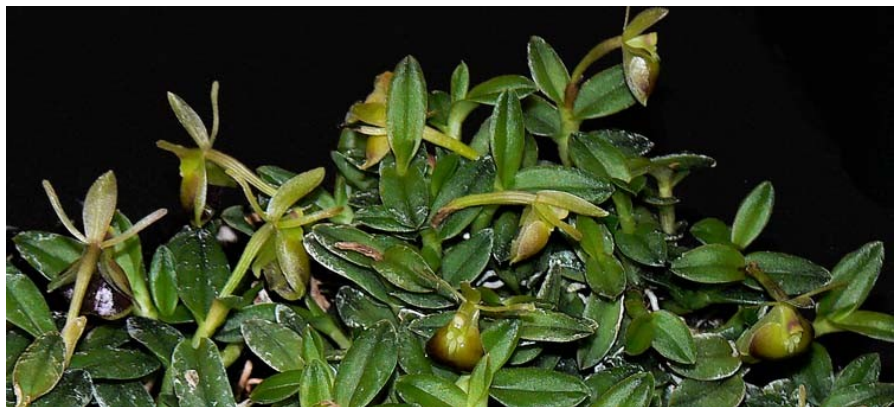
Close-up of flowers