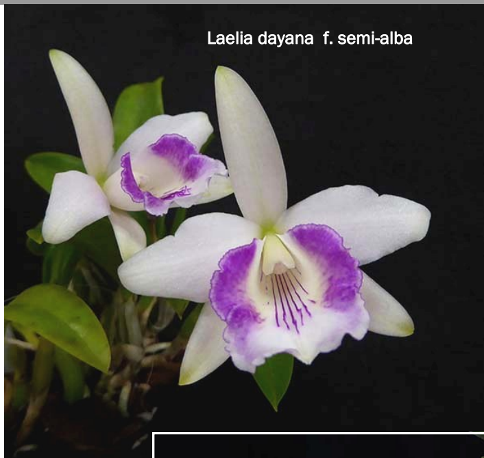
Laelia dayana f. semi-alba

Laelia dayana is native to southeastern Brazil. It grows in bright, indirect light on moss-covered trees, mostly near streams or seeps, at elevations of 2950-4550 ft. (900-1300 m) Charles Baker (in Orchidwiz ) indicates that the temperature in its habitat can get down to freezing. High humidity appears to be an important requirement.